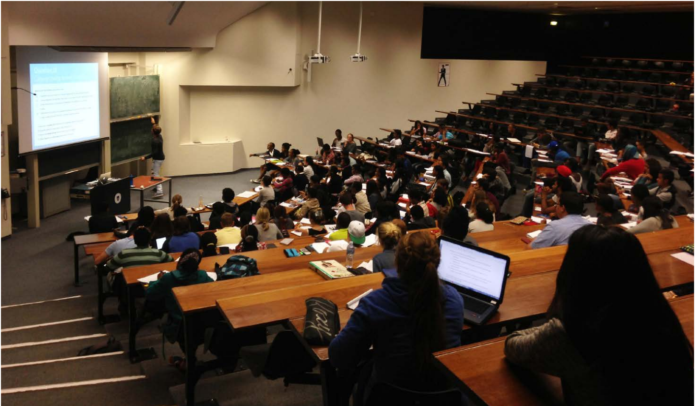
Above: The Earth-based education system - a source of derision for The Master Aetherius.

own way, to give sustenance to a higher lifeform, and perhaps the Venusian would offer some energy recompense to the plant, such as a blessing of some kind. This would not be demanded by the plant, but nevertheless gratefully accepted. All of this would be in perfect harmony with the spirits of nature, sometimes referred to as "devas".